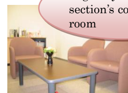
Higashiyama section's consulting room

Tsurumai section Tuesday (excluding holidays) 9:00~17:00 The old west ward 452 Tel&FAX : 052-744-2827